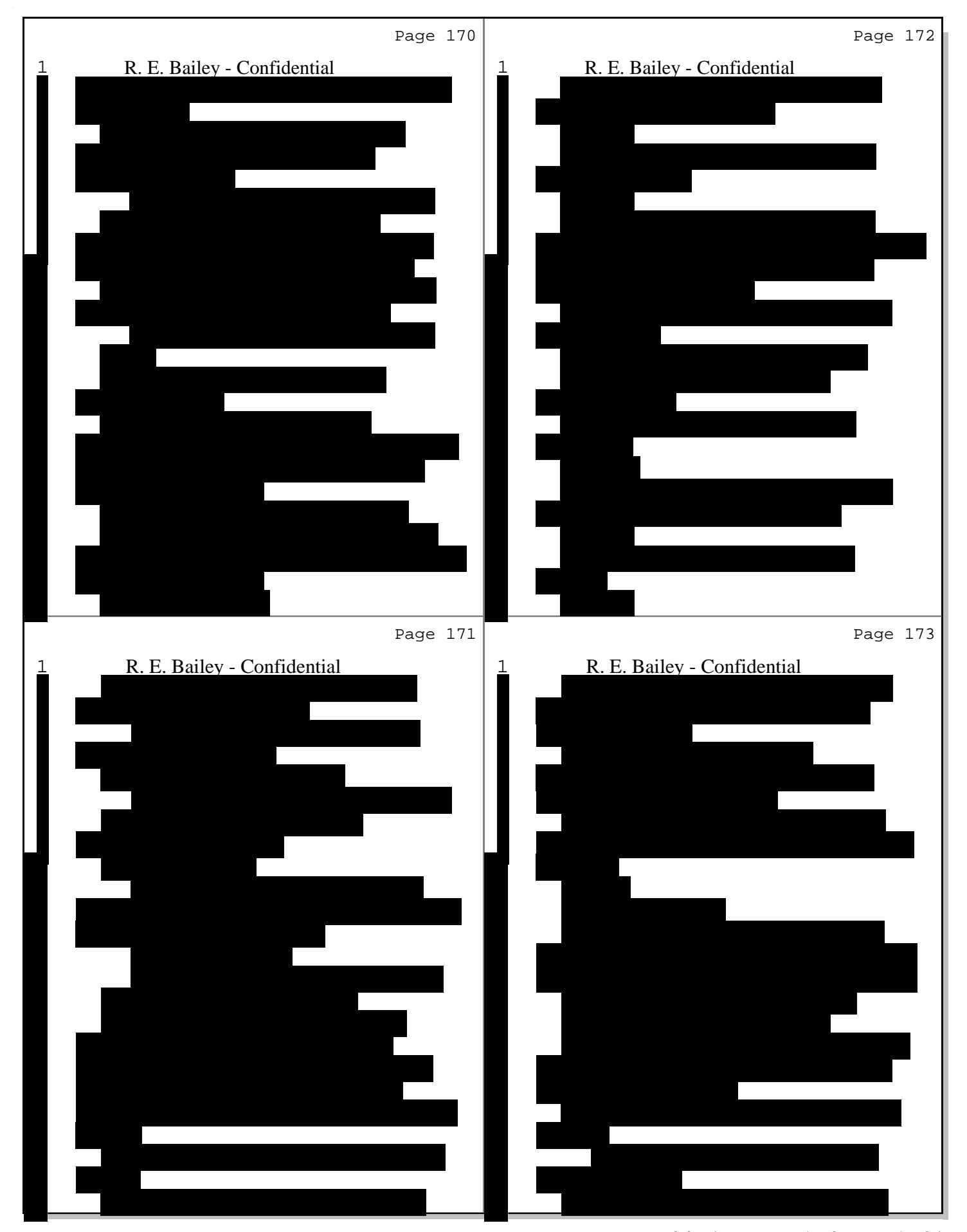
44 (Pages 170 to 173)